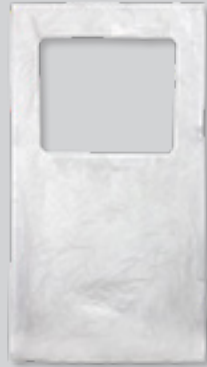
LBSF500HD U.S. Patent No. 9,957,105

SecureFit360® poly liner bags are custom designed with a unique strap that wraps around the bottom of the receptacle to secure in place and enclose waste for fast, easy and safe removal. Strap keeps the bag tight fitting so it doesn't collapse inside the receptacle.